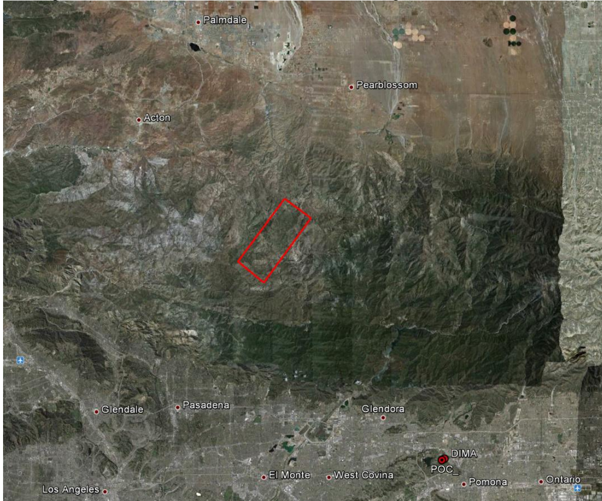
Figure 1 – Shape and location of survey polygon.

The survey area consisted of a polygon located in San Gabriel Mountains, 22 miles Northeast of Los Angeles, California. The location is shown below in Figure 1.